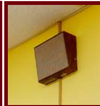
REPLACE P.A. SYSTEM AND SPEAKERS BUILDING WIDE