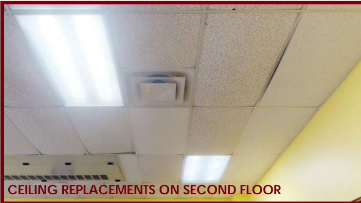
CEILING REPLACEMENTS ON SECOND FLOOR

REPLACE OLD BUS LIFT WITH A NEW IN-GROUND BUS LIFT. THE NEW LIFT WILL BE CAPABLE OF LIFTING AN ELECTRIC BUS. THE ELECTRIC BUSES ARE HEAVIER COMPARED TO DIESEL BUSES. THE DISTRICT FEELS IT IS PROACTIVE TO PROVIDE A HIGHER CAPACITY LIFT BECAUSE OF MANDATES FROM THE STATE FOR DISTRICTS TO CONVERT TO ELECTRIC VEHICLES. THE CURRENT BUS LIFT IS ALSO REACHING THE END OF ITS USEFUL LIFE.