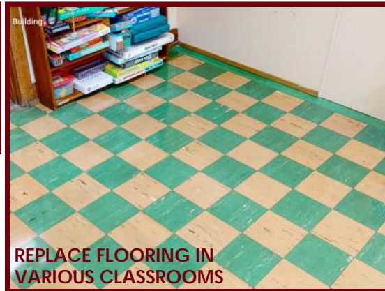
REPLACE FLOORING IN VARIOUS CLASSROOMS